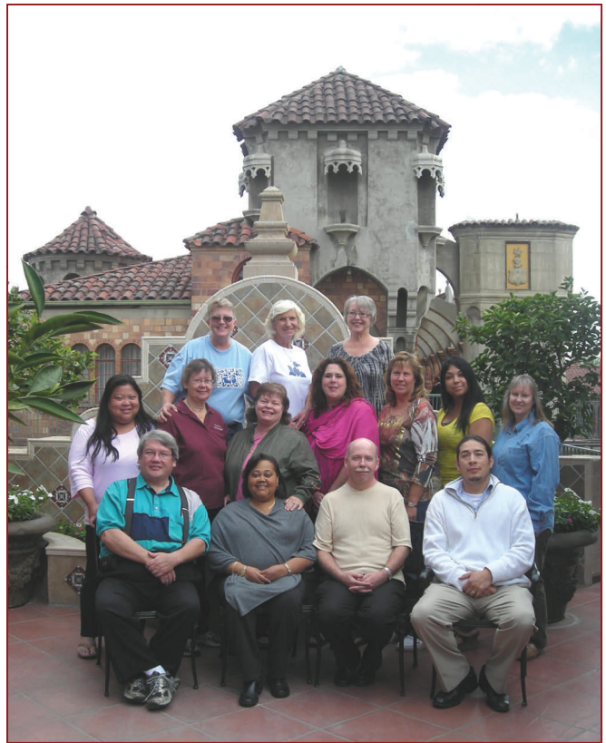
Photo taken at Mission Inn Hotel & Spa, October 2010.